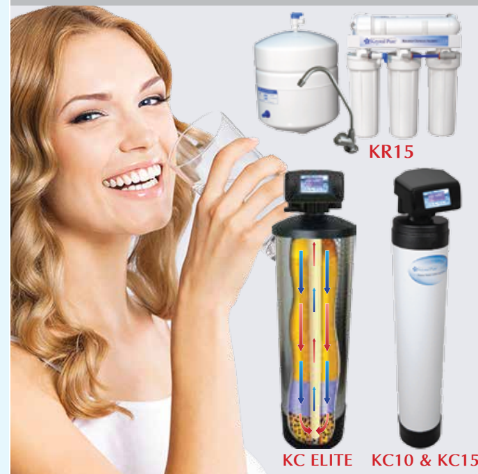
KC ELITE KC10 & KC15

Transferable Lifetime Major Parts Warranty on: KC Tanks – Valve 4